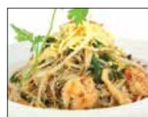
House Special Mei Fun