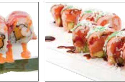
Painted Lady Roll