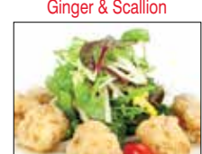
Crispy Sea Scallop