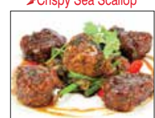
Wok Sautéed Beef Tenderloin