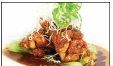
Crispy Red Snapper