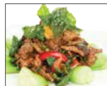
Thai Basil Steak

Vegetable Udon Soup 10 Pad Thai Thai Rice Fettuccine 15 Choice of Veg., chicken, pork, beef or shrimp Tempura Udon Soup 13 Mei Fun Rice noodle 15 Choice of Vegetable, chicken, pork, beef, shrimp or house special Nabeyaki Udon Soup 15 Chicken, shrimp tempura, egg & veg. Lo Mein 15 Choice of Vegetable, chicken, pork, beef, shrimp or house special Seafood Udon Soup 17 Jumbo shrimp, fish, scallop, crabmeat & veg. Chow Fun 15 Choice of Veg., chicken, pork, beef or shrimp Yaki Udon Pan-fried Japanese noodle Veg, Chicken or Pork 15 Fried Rice 15 Choice of Vegetable, chicken, pork, beef, shrimp or house special Beef or Shrimp 15 Pineapple Fried Rice 15 Chicken 15 Seafood 17 Shrimp 15 Soba Buck Wheat noodle Veg, Chicken, Pork, Beef or Shrimp 15 Seafood 17