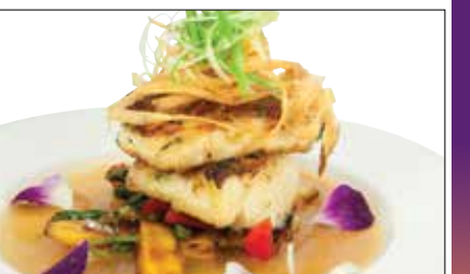
Pan Roasted Chilean Seabass