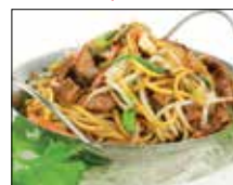
Beef Lo Mein