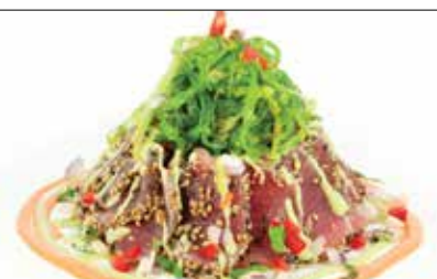
Pan-Seared Tuna w. Soba Noodle