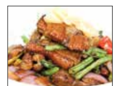
Duck w. Wok Glazed Ginger & Scallion