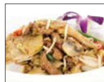
Beef Chow Fun