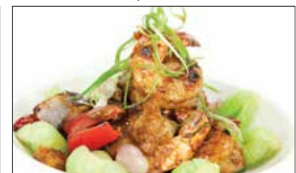
Wok Grilled Garlic Shrimp