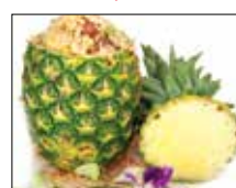
Chicken w. Pineapple Fried Rice