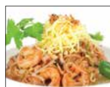
Shrimp Pad Thai