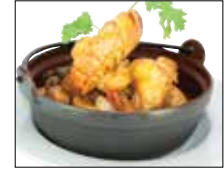
Seafood Rainbow Casserole